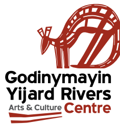
Godinymayin Yijard Rivers Arts & Culture Centre